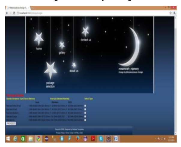
Fig. 7: Package Selection