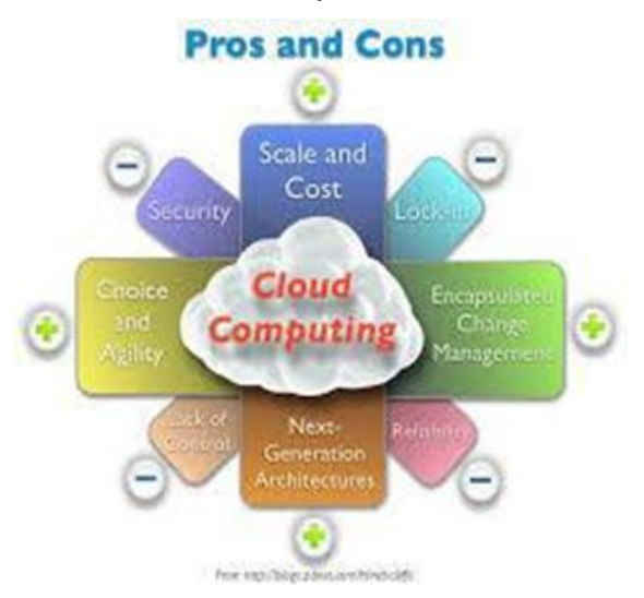
Fig. 3: Pros and Cons

The trusted third party may be a single server or multiple servers. The symmetric keys are protected by combining the public key cryptography and the (k, n) threshold secret sharing schemes. Nevertheless, such schemes do not protect the data files against tempering and loss due to issues arising from virtualization and multi-tenancy.