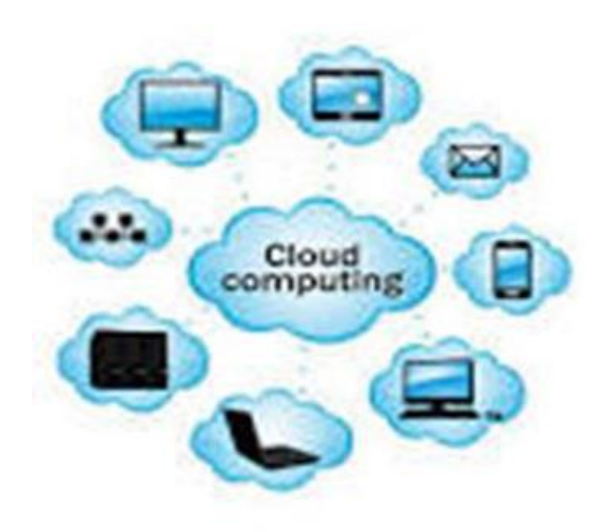
Fig. 2: The Fragments

From the above discussion, we can deduce that both security and performance are critical for the next generation large-scale systems, such as clouds. Therefore, in this paper, we collectively approach the issue of security and performance as a secure data replication problem.