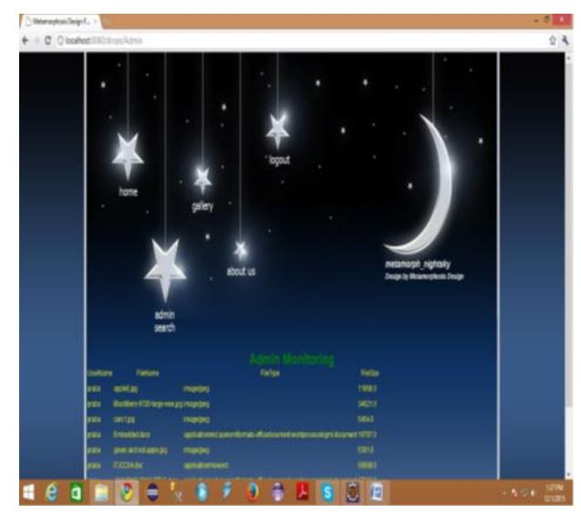
Fig. 9: Admin Monitoring