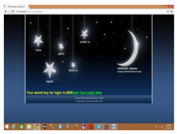
Fig. 6: Secret Key for Login

However, in the second iteration that node is selected that produces the lowest RC in combination with node already selected. The process is repeated for all of the file fragments. Details of the greedy algorithm can be found in [18].