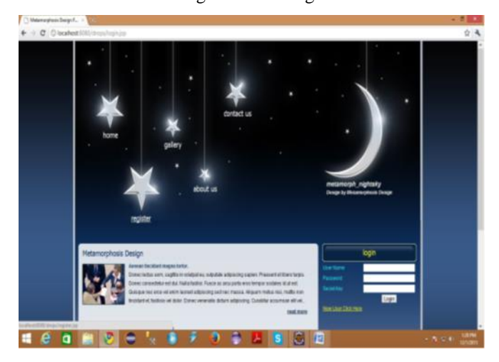
Fig. 5: Login Page

In SA1, at level R or below, only the best successors of node n having the least expansion cost are selected. The SA2 selects the best successors of node n only for the first time when it reaches the depth level R. All other successors are discarded. The SA3 works similar to the SA2, except that the nodes are