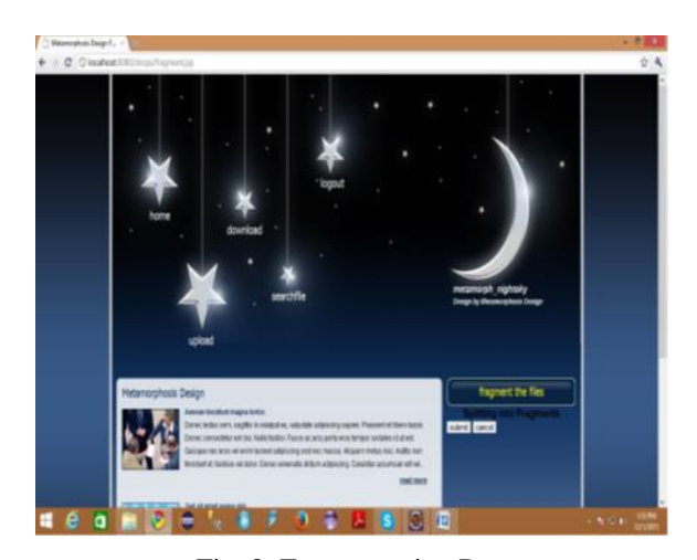
Fig. 8: Fragmentation Page