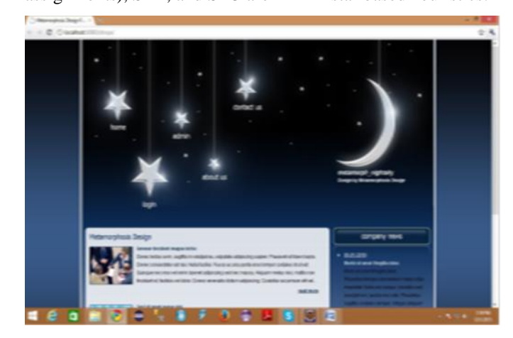
Fig. 4: Home Page

The FOCAL list contains only those nodes from the OPEN list that have f greater than or equal to the lowest f by a factor of 1 + s. The node expansion is performed from the FOCAL list instead of the OPEN list. Further details about WA- Star and As-star can be found in [13]. The SA1 (sub-optimal assignments), SA2, and SA3 are DRPA-star based heuristics.